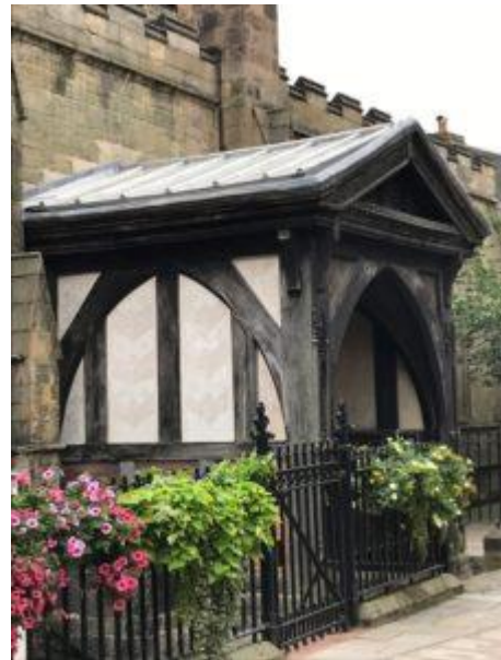
North Porch with new roof covering

The main building works for Leicester Cathedral Revealed will commence in the second half of September with the dismantling of the Old Song School. This will be followed by careful archaeological excavation to enable the construction of the basement for the new visitor and learning centre extension.