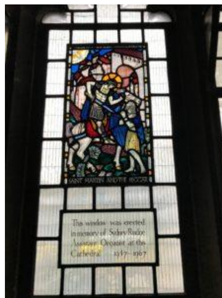
Stained glass window from the Old Song School