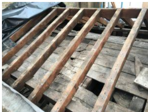
North Porch showing uncovered medieval oak roof under the later timbers

We have started work on the repair and restoration of the North Porch, which will involve replacing the damaged lime render pargetted panels on either side of the porch and repairing the roof. Preliminary work on the roof earlier this week has found the fabric to be dry and in reasonable condition, which is good news.