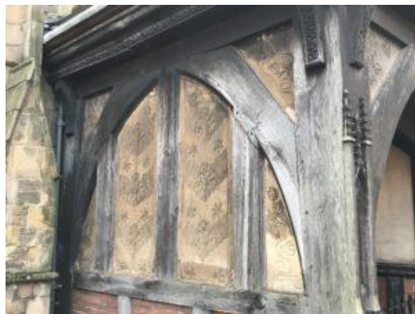
North Porch showing lime render pargeted panels to be restored

The North Porch is a key access point for the Cathedral and is, originally, a predominantly medieval timber structure. We are pleased to have completed the timber preservation and this also involved the repair of a couple of splits in the rafters, caused by knots, which we have reinforced with brackets and plates.