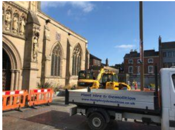
Demolition works starting

Whilst we all breathe a mighty sigh of relief and continue to give thanks for the wonderful generosity of so many individuals and grant-givers, our eyes turn to focus on the practicalities of what happens next.