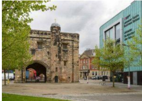
The Magazine, Leicester

The business has two regional offices in Birmingham and Staffordshire and in 2018 completed the construction of its new head office and training centre near Stamford, Lincolnshire.