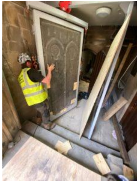
Removal of the Tournai Stone