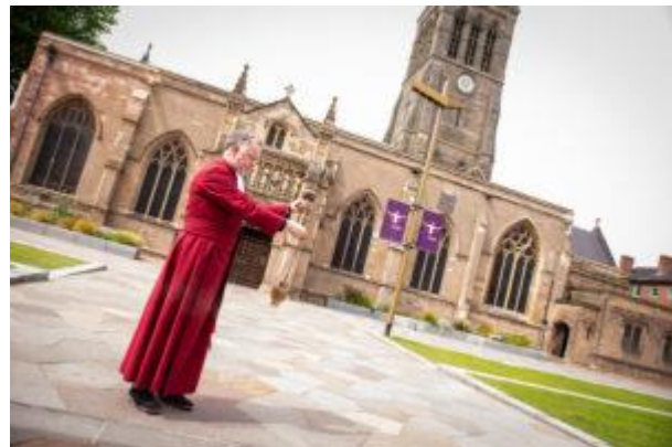
Dean David blessing the site

Chapter were able to make the decision following confirmation of an increased grant of £1.56m from the National Lottery Heritage Fund and grants of £350k each from Leicester City Council and Leicestershire County Council. A number of individual supporters have also made generous donations.