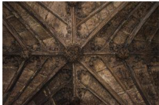
North Porch ceiling

It won't be long before you will see scaffolding going up around the North Porch. This is to undertake some repair and restoration work which is so urgent we took it out of the Leicester Cathedral Revealed main project so we could get started straight away. We have been fortunate to receive generous grants to do this from Historic England under the Government's Cultural Recovery Fund, and from the National Lottery Heritage Fund.