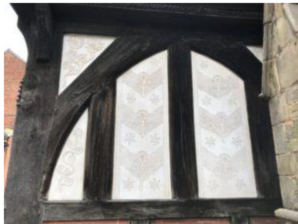
North Porch showing restored lime render pargetted panel